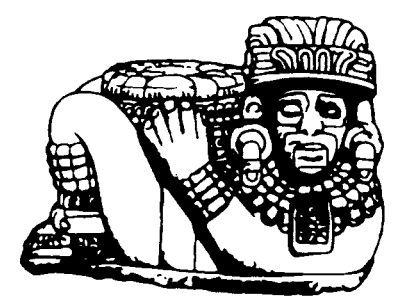
The Aztec Chac Mool; Great Master of a Serpentine Civilization

in the fullest sense of the word, he must learn to take the solar energy from its deposit in the solar plexus to the frontal chakra. The man- tram SUI-RA is the key that permits us to extract solar energy from the plexus of the Sun to carry it to the frontal chakra. Vocalize in this way: SUIII RAAA. When practiced one hour daily the result will be the positive awakening of the frontal chakra If we want Solar strength for the laryngeal chakra, we should vocalize the man- tram SUE-RA in this way: SUEEE RAAA. If we need solar energy for the lotus of the heart, we should vocalize the mantram SUO-RA in this way: SUOOO RAAA. Everything is summarized in the Great SUA-RA, where according to the Vedas and the Sastras the Silent Gandharva (celestial musician) is found. It is necessary to know how to use the solar energy deposited in the solar plexus. It is good for the aspirants of initiation to lie down in the, decubitus—dorsal position, feet on the bed, knees raised. Clearly, by putting the soles of the feet on the bed, the knees are lifted, directed towards the sky, towards Urania.