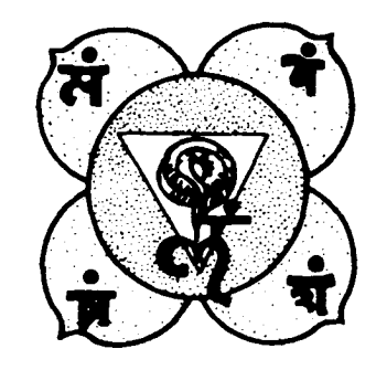
Church of Ephesus

The chakras of the gonads (sexual glands) are directed by Uranus, and the pineal gland situated in the superior part of the brain is controlled by Neptune. An intimate correlation exists between this pair of glands, and Kundalini must unite them with the Sacred Fire to obtain profound Self-Realisation.