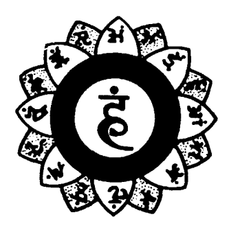
Church of Sardis

The second chapter of the Apocalypse (Revelation) deals with the four inferior Churches of our organism. These are four œnters known as: the fundamental or basic, the prostatic, the umbilical and the cardiac. Now we shall study the three superior ma centers mentioned in the third chapter of Apocalypse. These three superior Churches are: the Church of Sardis, the Church of Philadelphia and finally, that of Laodicea.