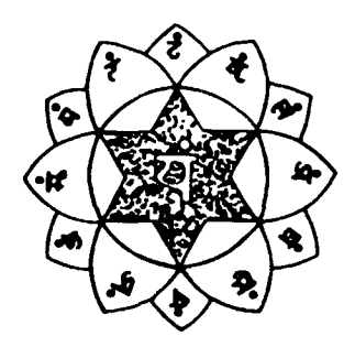
Church of Thyatira

With the ascent of Kundalini to the region of the heart, the Church of Thyatira with its twelve marvelous petals is put into activity. This Church confers on us power over the Elemental Air of the Wise. The development of this cardiac centre confers inspiration, premonition, intuition and powers to leave consciously in the astral body, as well as the powers to put the body into the state of Jinas.